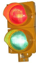
CUERPO 12/100 INCANDESCENTE