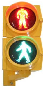
CUERPO 12/100 INCANDESCENTE